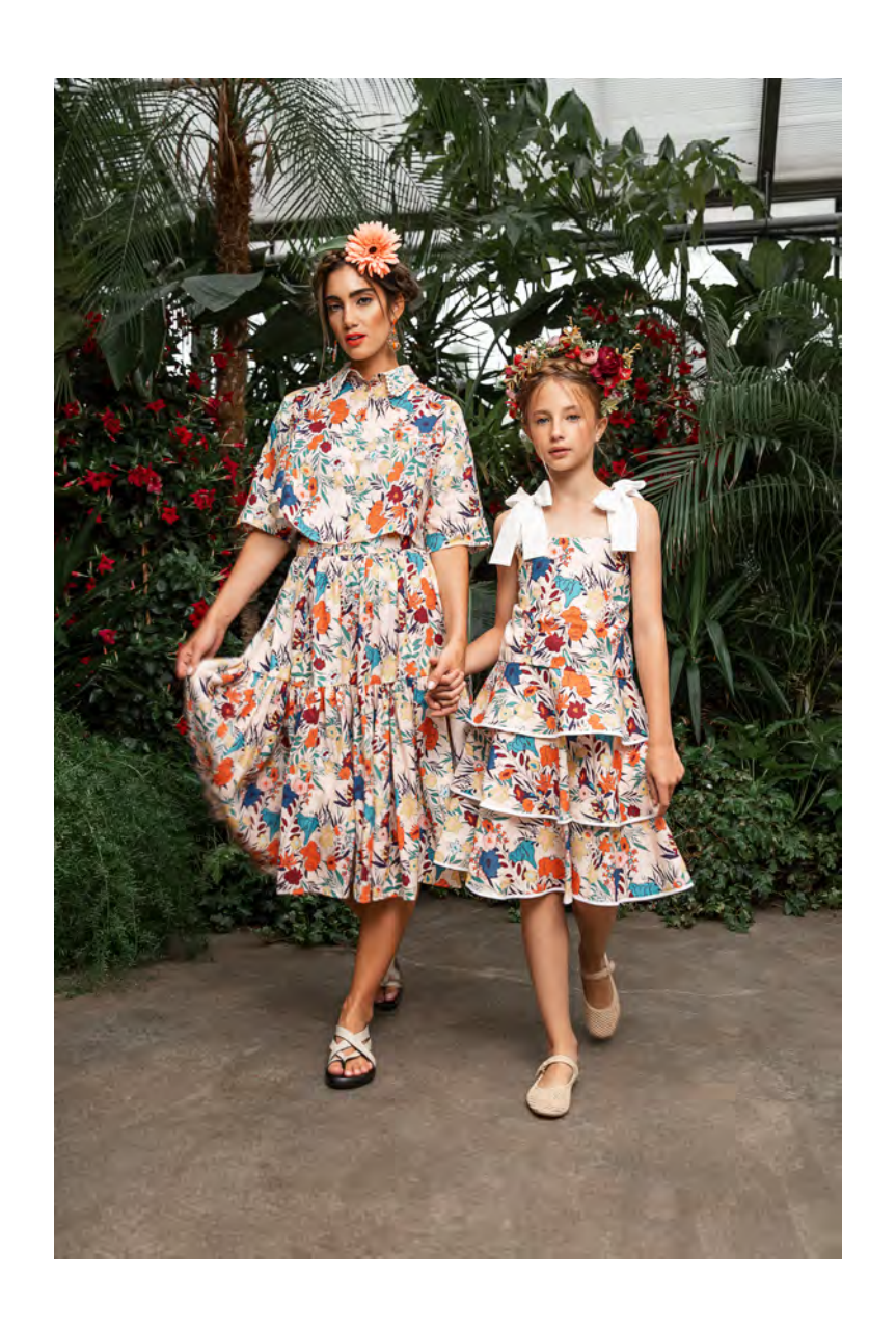
atelier P A R S M E I