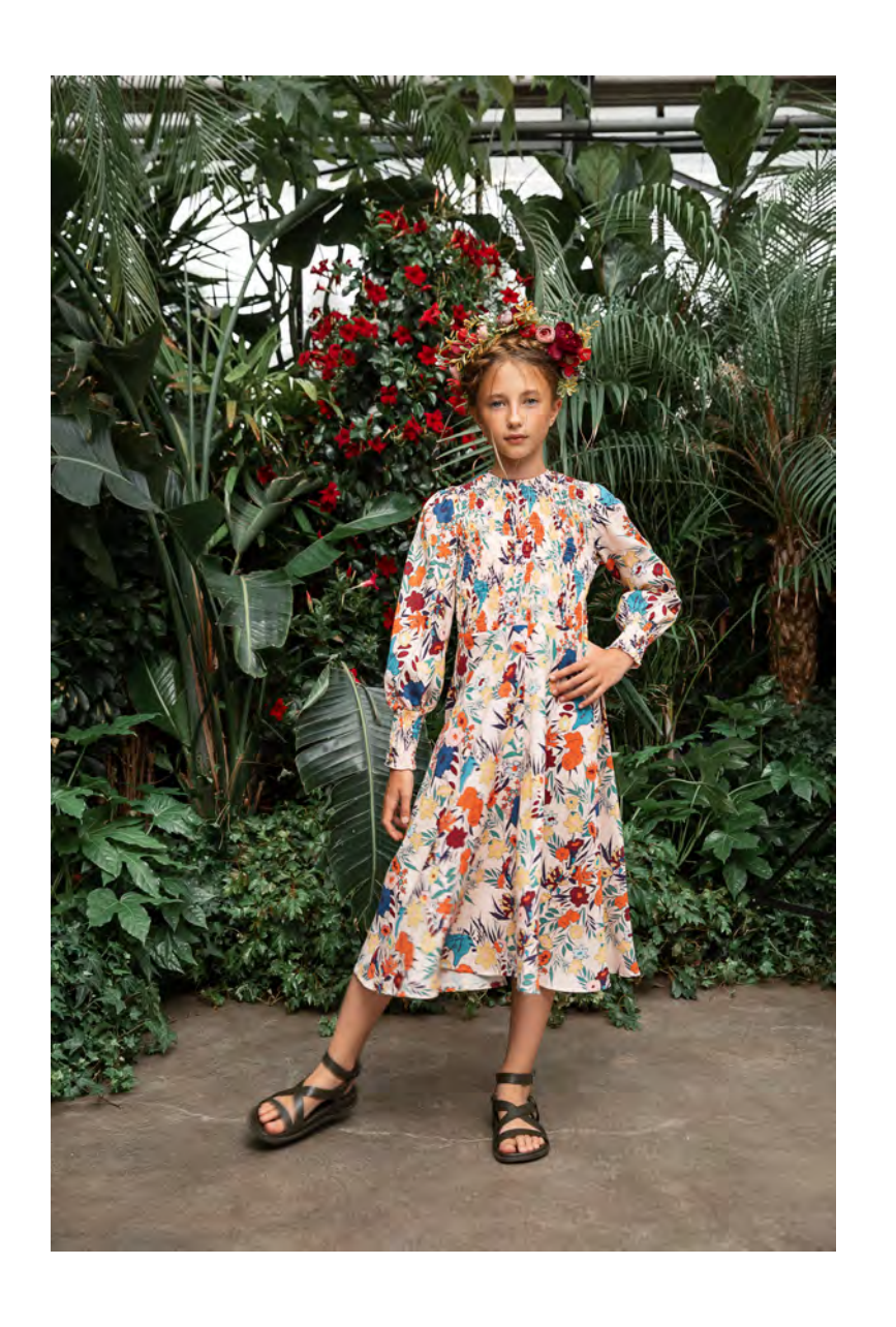
atelier P A R S M E I