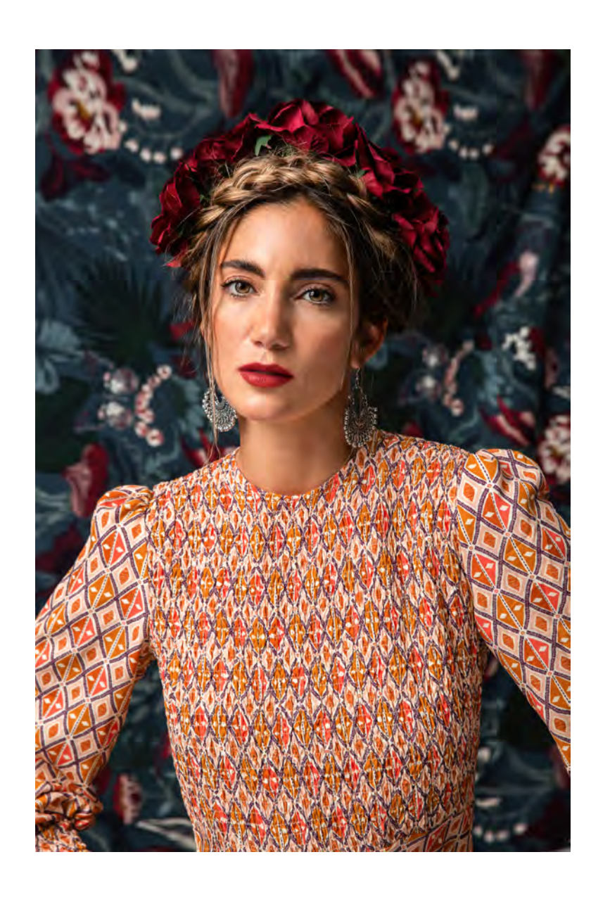
atelier P A R S M E I