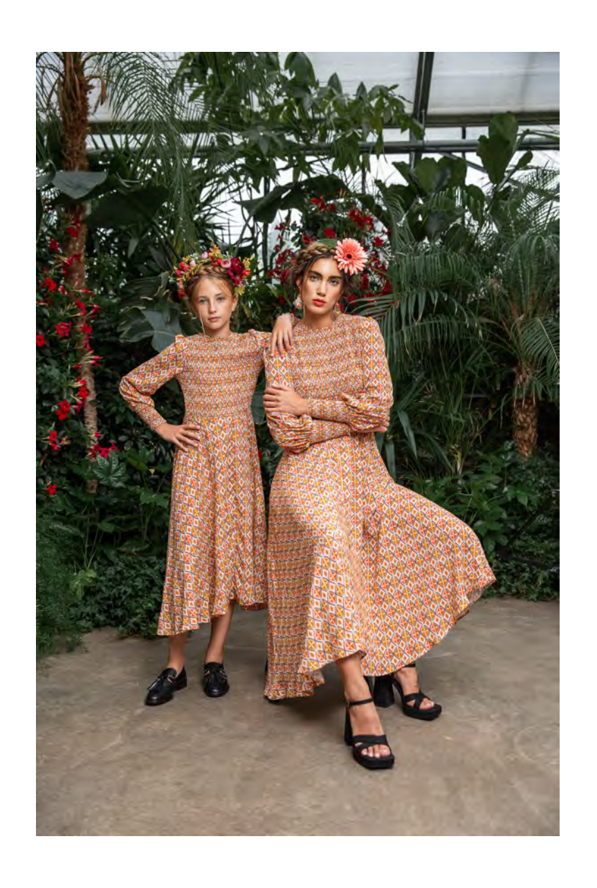
atelier P A R S M E I