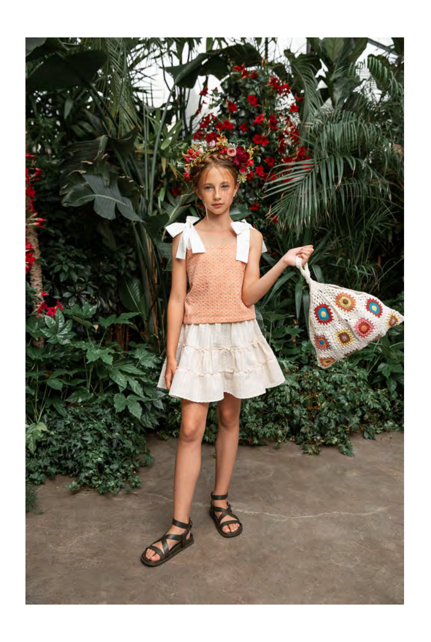
atelier P A R S M E I