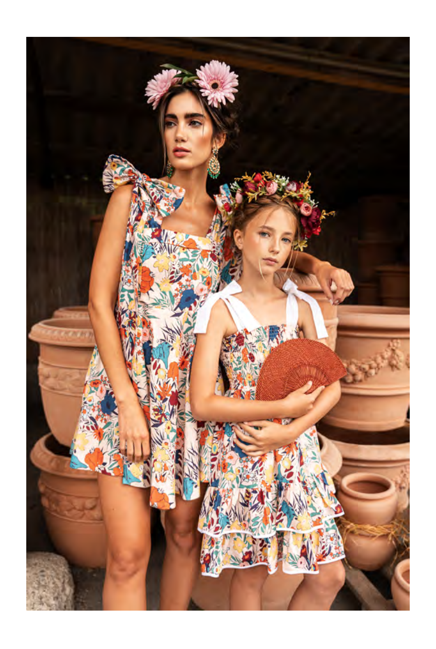
atelier P A R S M E I