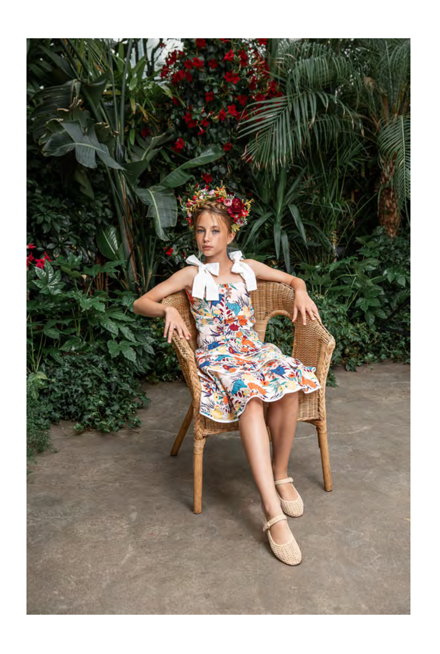
atelier P A R S M E I