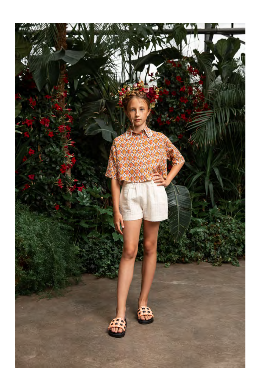
atelier P A R S M E I