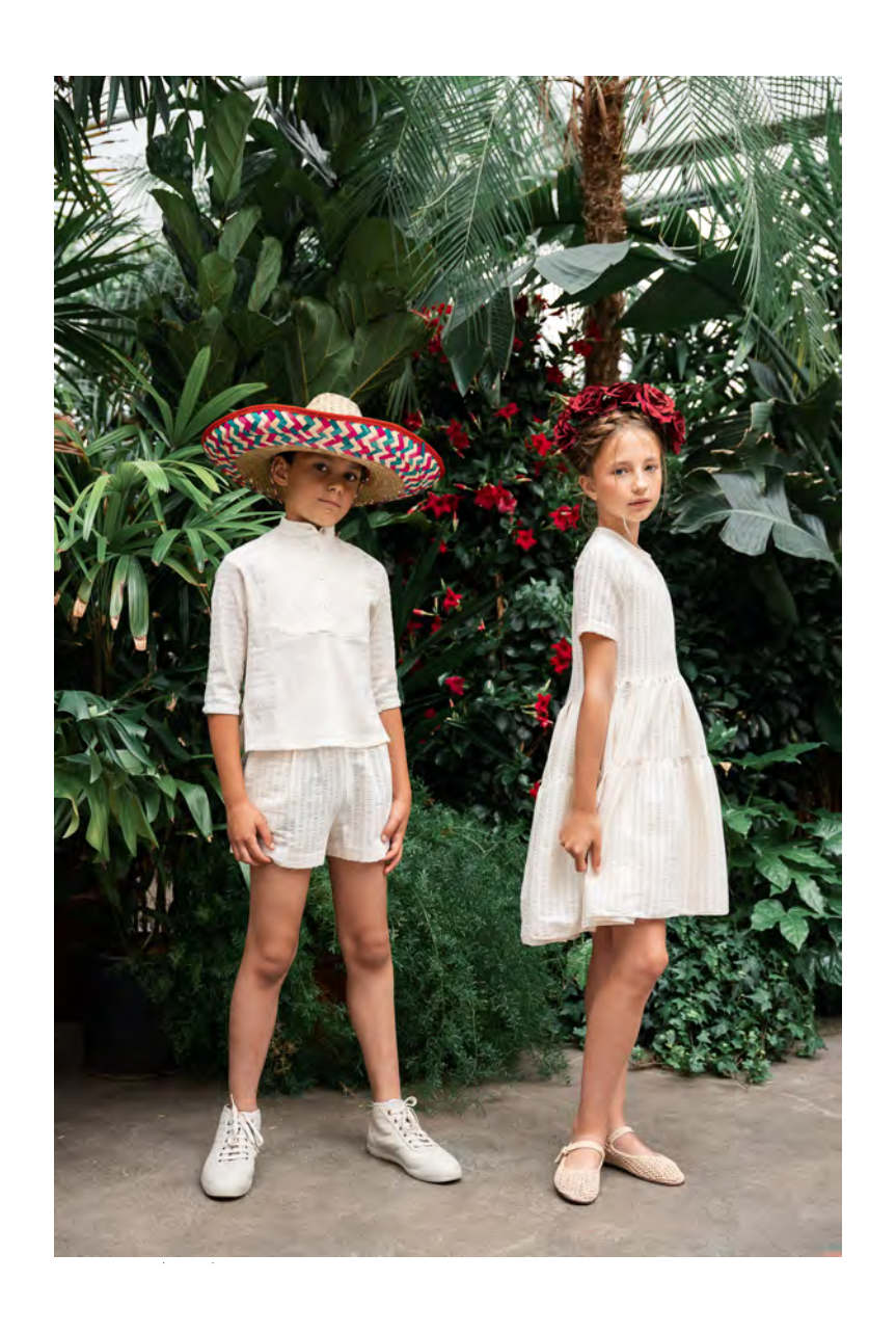
atelier P A R S M E I