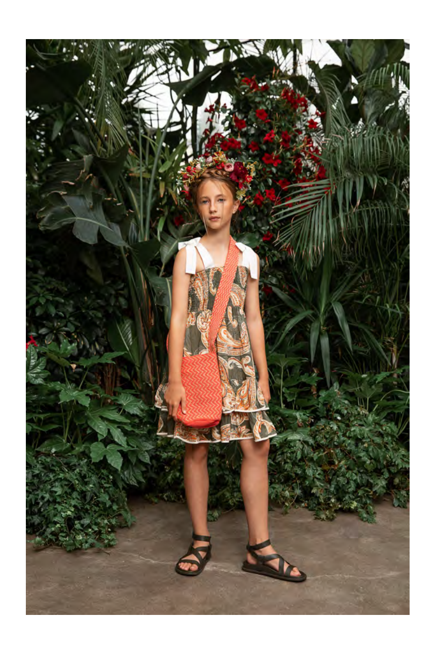
atelier P A R S M E I