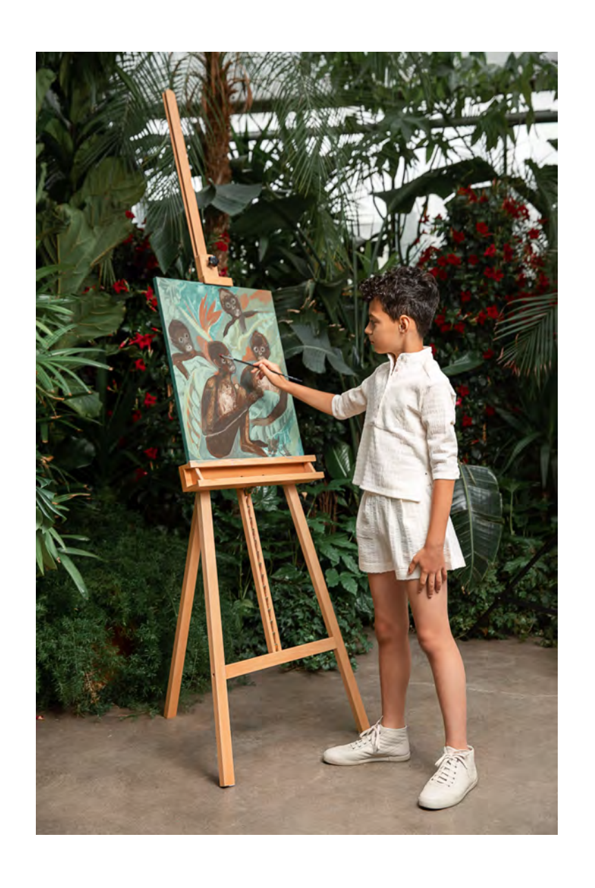
atelier P A R S M E I