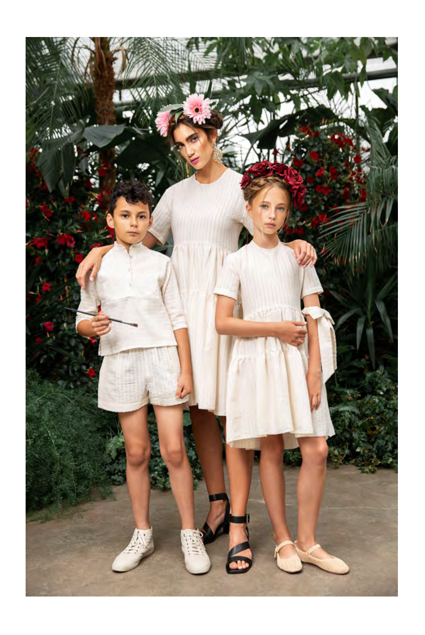
atelier P A R S M E I