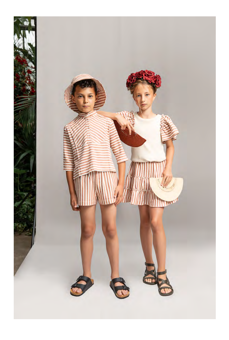
atelier P A R S M E I