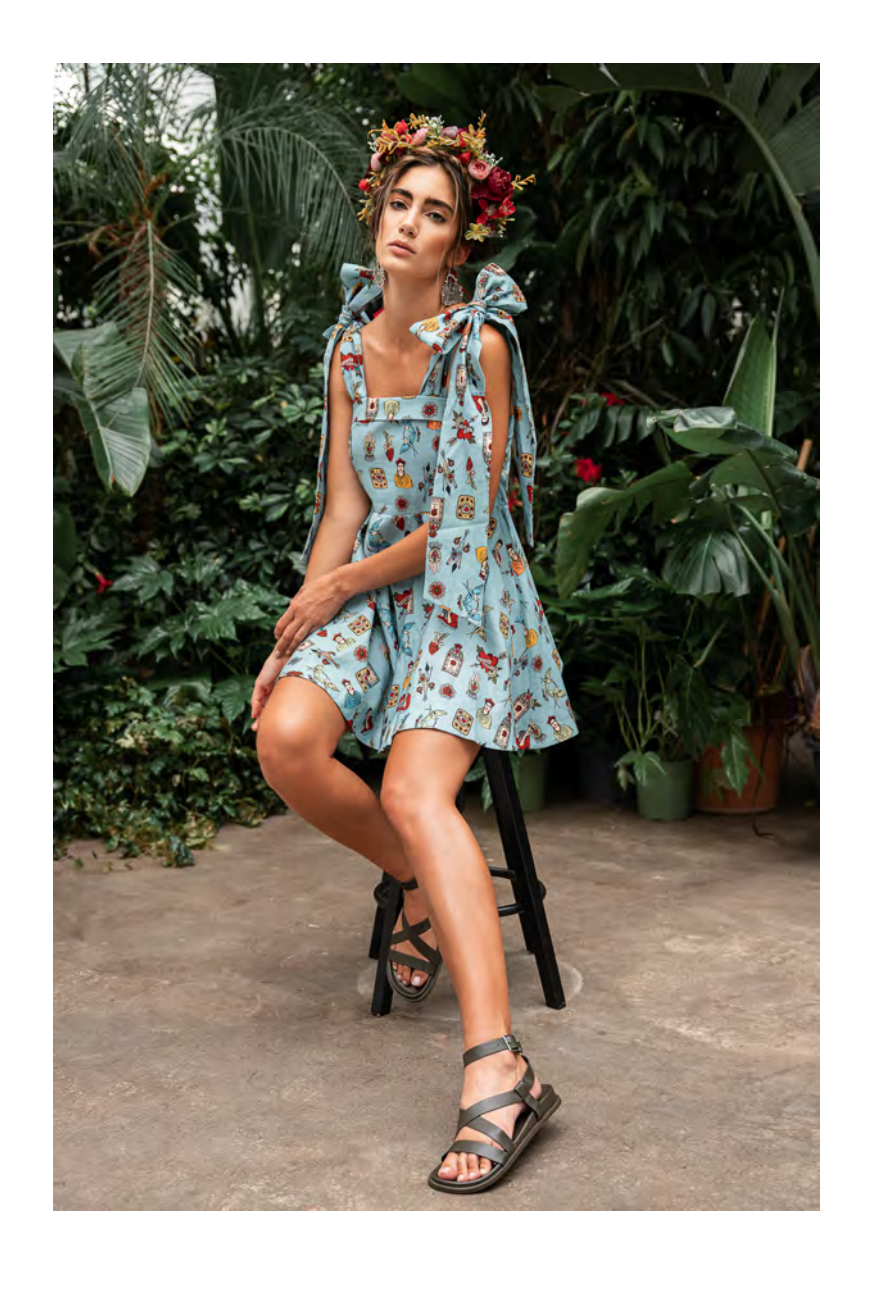
atelier P A R S M E I