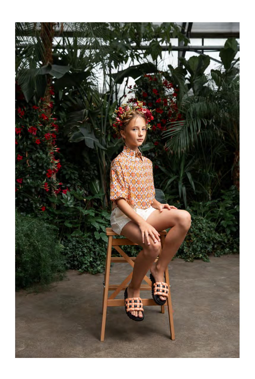
atelier P A R S M E I