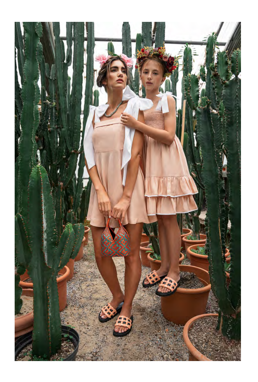
atelier P A R S M E I