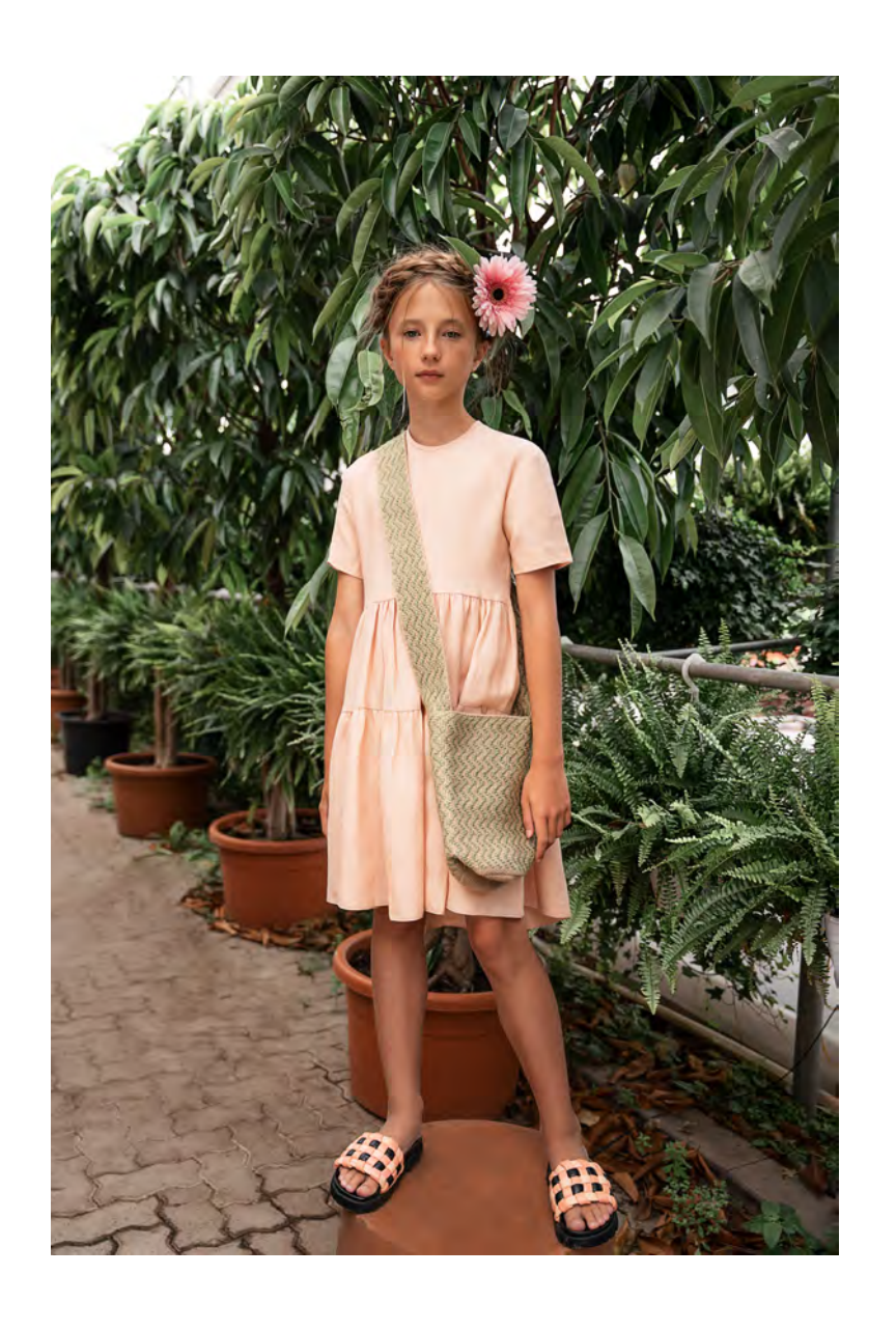
atelier P A R S M E I