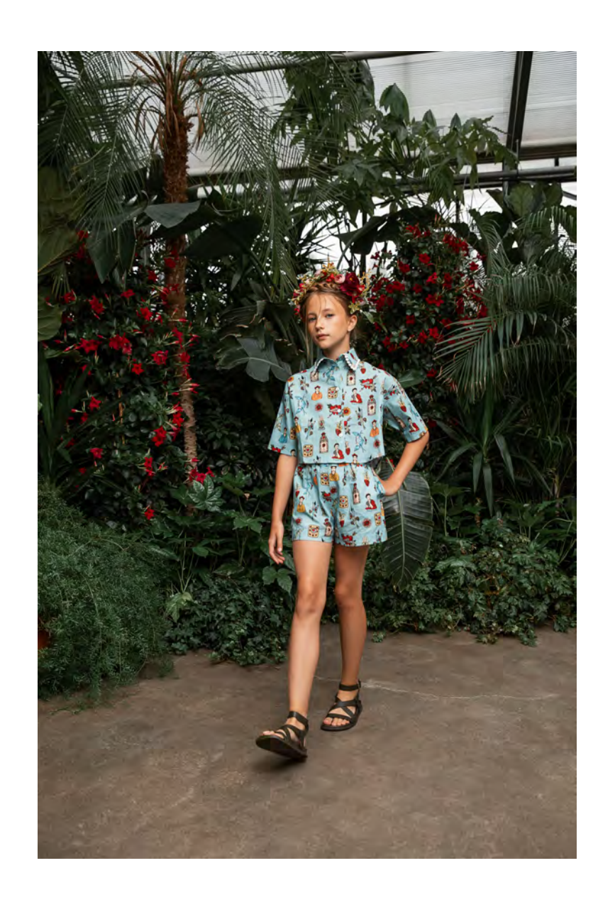
atelier P A R S M E I