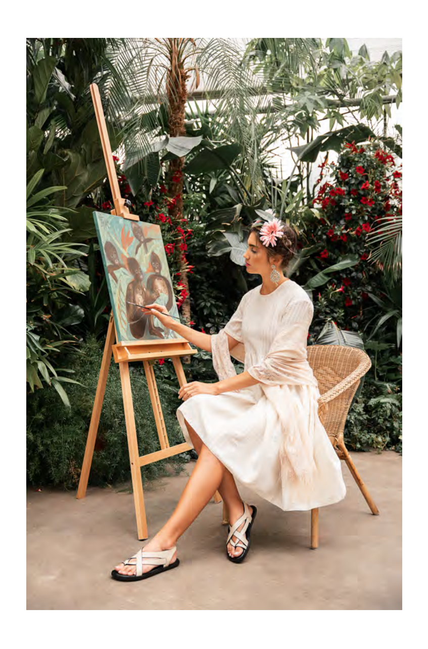
atelier P A R S M E I