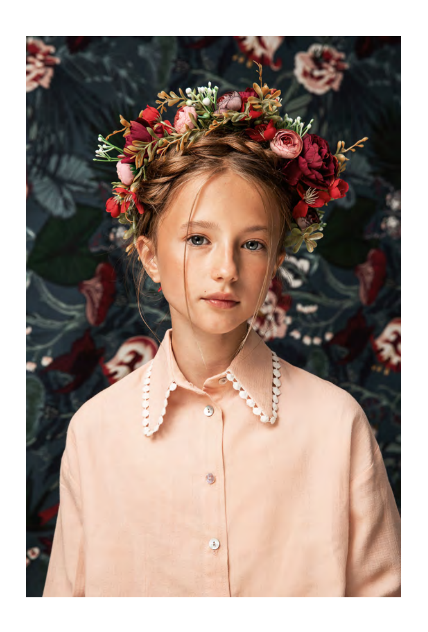
atelier P A R S M E I